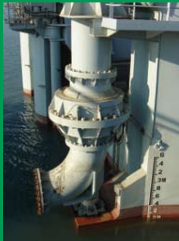
IHC swivel unit of the BEIYA 1 HAO

The pumping hearts of the IHC 7025MP cutter suction dredger are two high-efficiency dredge pumps, one single