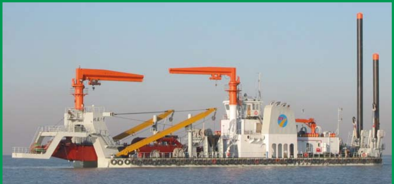
BEIYA 1 HAO

The market trend in China to go for an increase in scale of dredgers first became apparent in the mid nineties with the new building of cutter suction dredgers for a Chinese Waterway Bureau. These dredgers were designed for a nominal production of 1750m 3 /hr and they were the first dredgers in China to be equipped with spud carriers. The submerged dredge pump application was considered optional and was realised at a later stage. It was the prelude to a change in the market from small-scale dredging to operations at a large to huge scale. The trend can be described as: large dredging depth; great discharge length; high production output and sufficient accommodation for 24 hours operation and a sturdy seaworthy hull allowing for bad weather conditions.