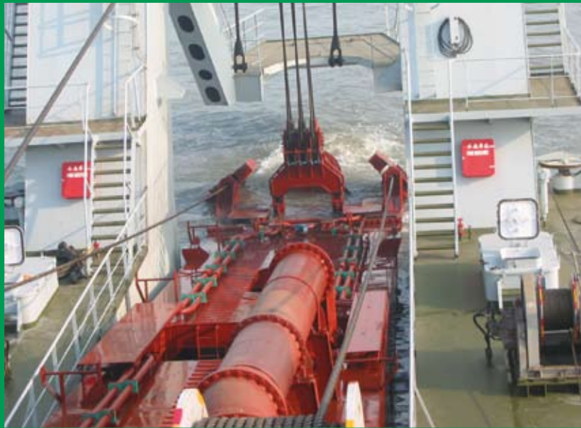
Cutter ladder of the BEIYA 1 HAO

for dredging in river estuaries where strong currents can be encountered, the IHC 7025MP is equipped with strong swing winches.