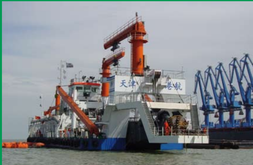
GANG HANG YUN 8 HAO

In 12 months' time the BEIYA 1 HAO had a production of over 10 million m 3 . The dredged material was silty sand that had to be pumped over 6km. The average dredging depth was about 20 meters. The client remains very enthusiastic about the performance of the BEIYA 1 HAO.