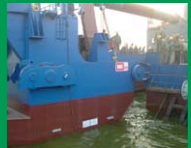
Spud carriage GANG HANG YUN 8 HAO

The IHC 7025MP can be delivered with two different types of cutter heads for different soil conditions. For soft soil an IHC cutter head is delivered with flared teeth, for compact sand and soft rock a cutter head with narrow teeth is provided. A special advantage of this dredger is that it can also be equipped with an IHC dredging wheel. This dredging wheel is interchangeable with the cutter ladder lower piece and enables dredging of sticky clay with a minimal investment. All existing IHC 7025MP dredgers can be equipped with a dredging wheel, making it a versatile piece of equipment suitable for various soil conditions.